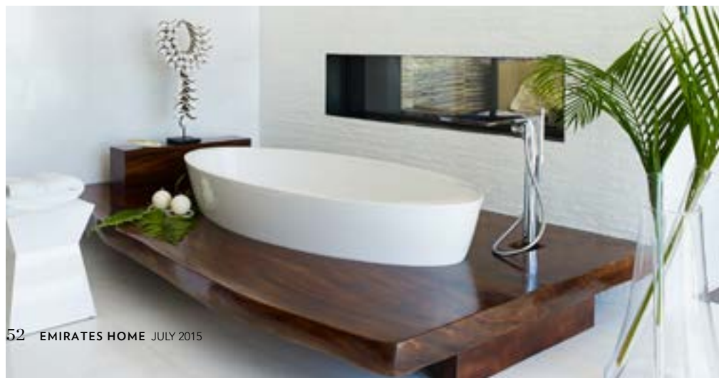
Clockwise: a light and airy Balinese-inspired bedroom with four-poster bed, which creates an understated luxurious feel; another, cosy master bedroom; office with statement feather lightshades; the contemporary master bathroom with nature-inspired accessories.

The opportunity to create a unique space and the architectural points of interest, such as the beautiful and dramatic 8 metre-high ground floor ceilings and formal entertaining space, are what stand out about this home. Dorothee could also collaborate with designers to create bespoke