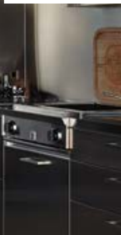
Left: the modern indoor/outdoor kitchen with feature lighting and beautiful wooden counter and chairs. Above: the family dog relaxes on a leather lounge.

“A well-considered material concept allows a seemingly effortless flow from one area to the next.”