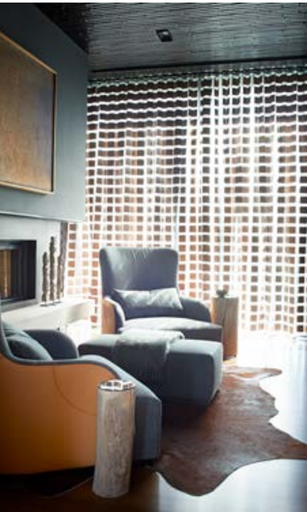
Clockwise from top left: bespoke staircase; wooden boats in the lush courtyard; the formal living room with large, custom-made statement light; the master living room; indoor/outdoor seating area that makes the most of the ocean views; the glass-fronted house has a gorgeous outlook; a corner of master living room with recliners.

“Contemporary elegant European furniture as well as Balinese design aspects, hinting on a subtle beach feel, became the focus of the initial style brief.”