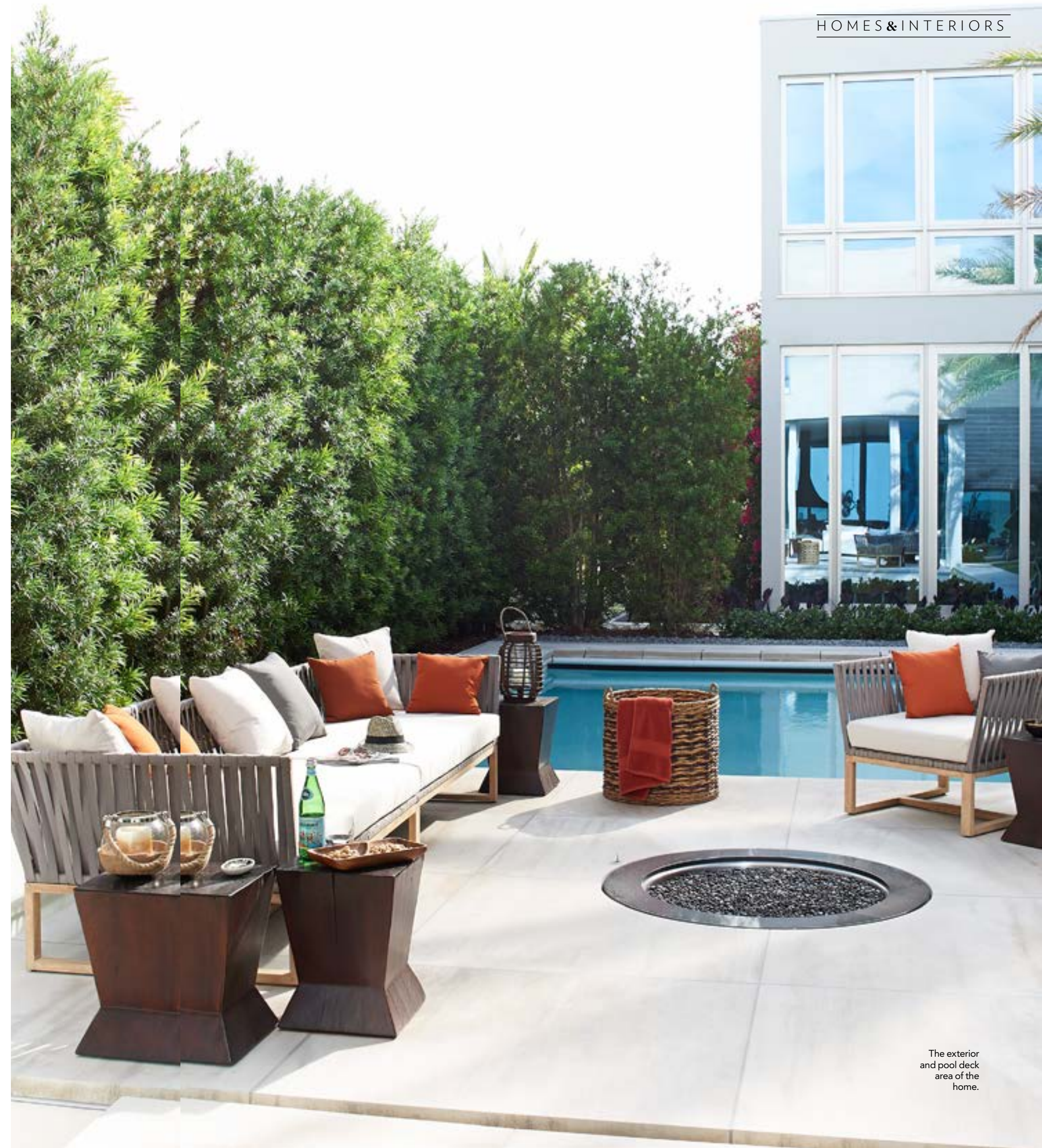
The exterior and pool deck area of the home.