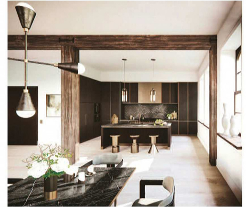
Next pages the NYC loft transformed into an open space in a understated contemporary interior style.